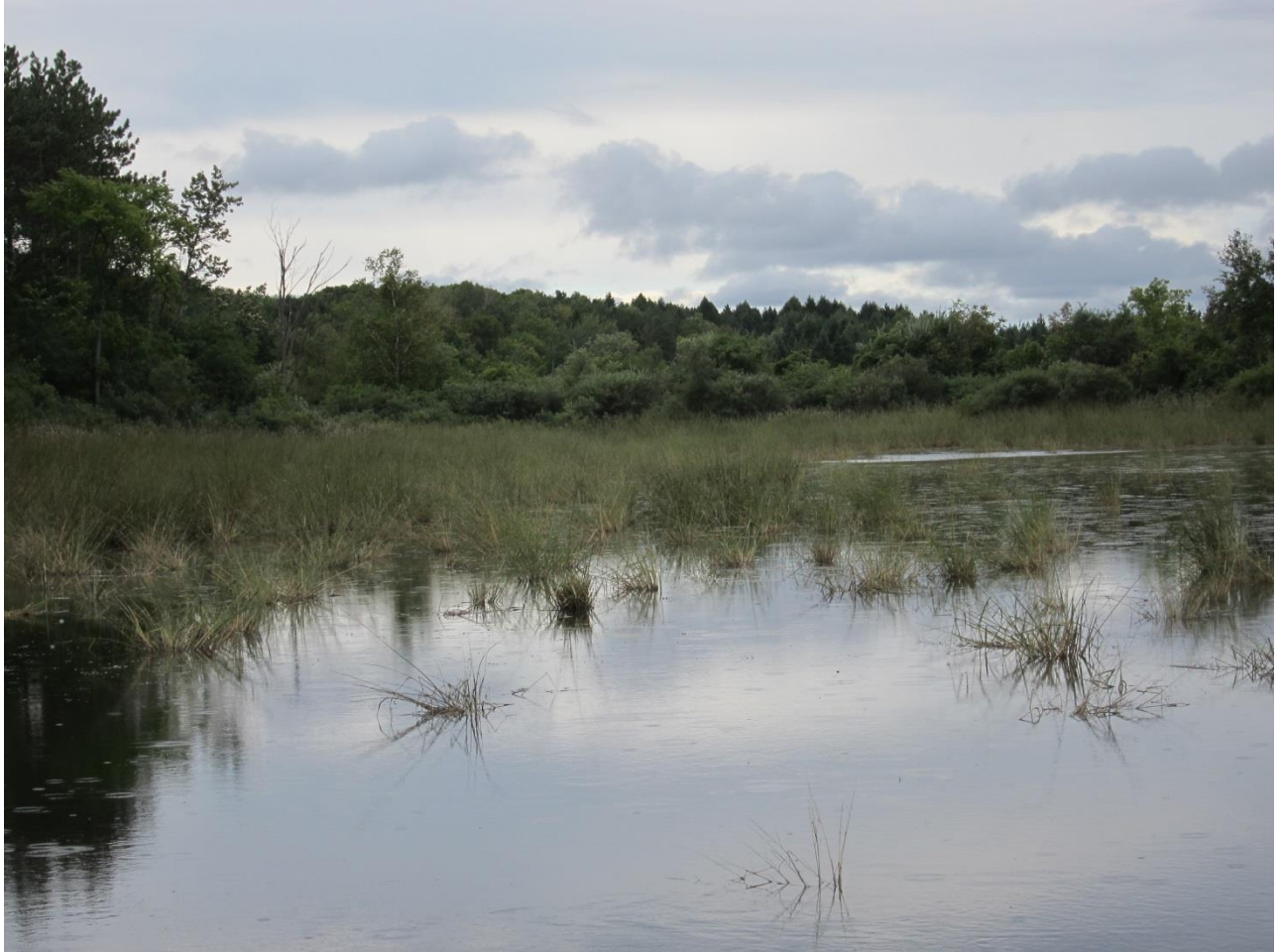
Figure 6. Wild Rice Organic Shallow Marsh community observed at Bloomington Wetland

One community, Grey Dogwood Mineral Thicket Swamp, is also on the original 1998 list but the example found at Claremont likely resulted from old shrub plantings. The other two communities are definitely of anthropogenic planted origin.