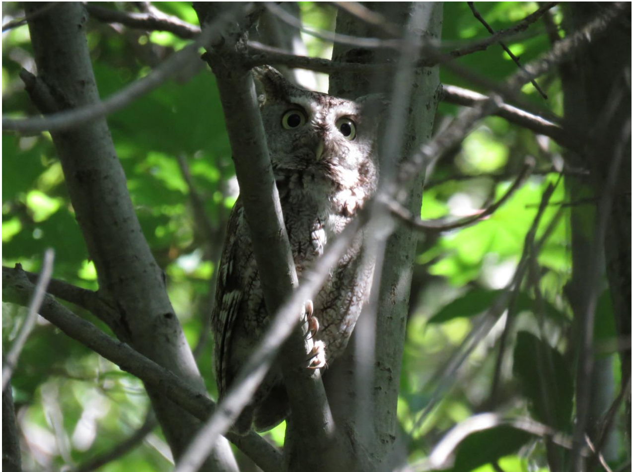
Figure 5. Eastern Screech-owl – frequently encountered throughout City ravines and along the forested parts of the Scarborough shoreline - regains its L4 status after a brief consideration as L3 (2015).

None of the changes in rank listed in Table 18 are particularly significant; especially given the fact that the majority of these changes are simply a reversal of very recent (2013 and 2015) changes in the opposite direction.