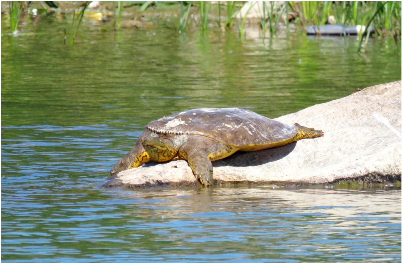
Figure 4. Spiny softshell turtle, large individual observed in mid-June, 2016.

In 2016, two new species were added to the regional terrestrial fauna list. A pair of American wigeon ( Anas americana ) were observed in suitable habitat until at least the middle of June. The second new species is Spiny Softshell ( Apalone spinifera ), a turtle species provincially listed as threatened. This animal was observed on one occasion basking however one previous sighting had been made – perhaps of the same individual – in the same location in 2015. It should be noted that, as with other sightings of rare herps in the region, there is some concern over the origins of this particular individual. It is possible that the animal had been intentionally transplanted to the area although experts are agreed that the individual is indeed the species that occurs in Ontario, primarily in the southwestern part of the province.