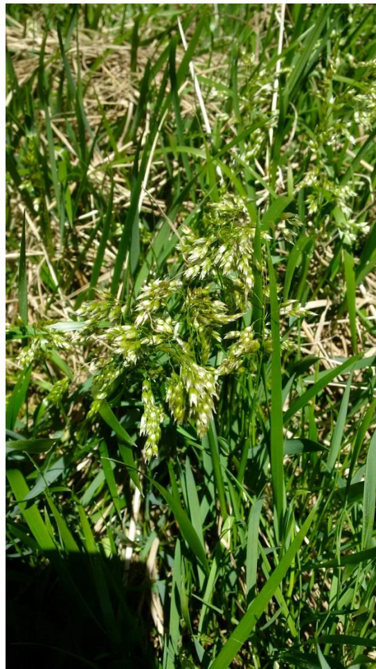
Figure 3. Sweet grass, rediscovered in 2016

Sweet grass, the fragrant grass that is used by First Nations in their ceremonies, has not been seen in TRCA since at least 1913 (Figure 3). It was rediscovered at Bloomington Wetland in 2016.